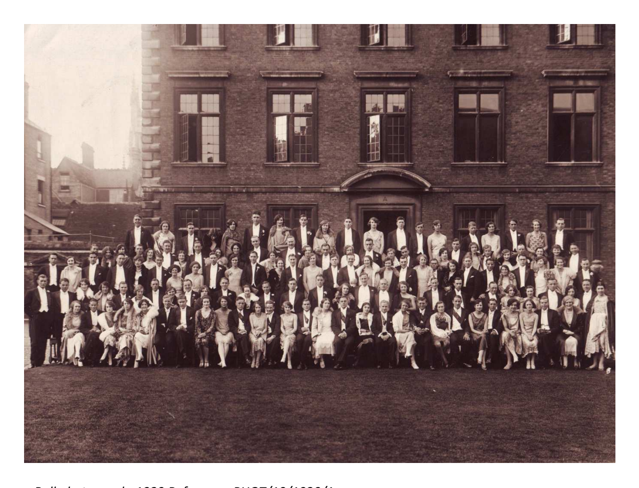
Ball photograph, 1929 Reference: PHOT/10/1929/1

In the background can be seen A Staircase of Main Court and to the left Sherlock Court. Note that the Lodge Bell and its tower is not in position; the Bell was not presented to the College until 1960, and not installed into Main Court until 1994.