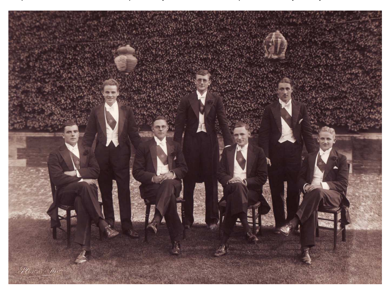
St. Catharine's College May Ball Committee, 1929 Reference: PHOT/10/1929/3

The focus here is on the Ball of 1929, one of the earliest Balls for which records survive. Happening between the two world wars, but at the start of the Great Depression, the Ball would probably be considered quite bland by today's standards.