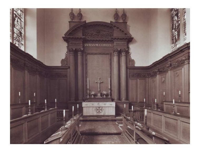
Chapel interior, c. 1930s Note the presence of carpet in the centre and the altar cloth Reference: PHOT/3/10/1

The Chapel has remained relatively unchanged since its consecration in 1704. Some of the fixtures and fittings have changed over time and several stained glass windows have been added, the most recent of which was put in during the summer of 2012.