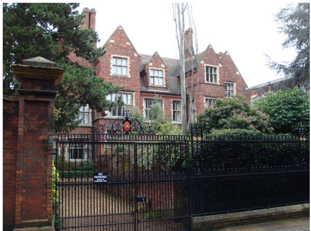
View of the Master's Lodge from Queens' Lane, 2011. Reference: PHOT/3/4/14

The Archivist is always pleased to answer questions about the College. Enquiries should be directed to archivist@caths.cam.ac.uk , or call 01223 338343. The Archivist only works for the College on Thursdays and Fridays so there is sometimes a delay in being able to answer queries.