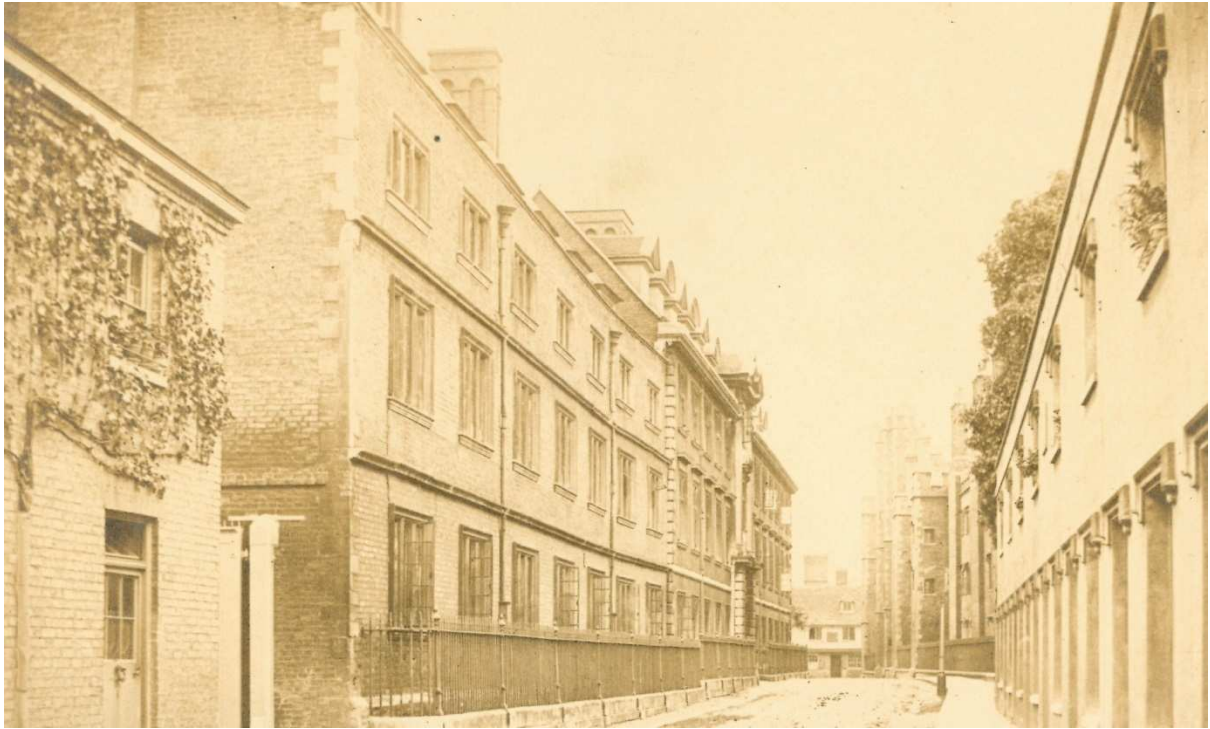
View of Queens' Lane towards Silver Street showing metal railings taken from Memorials of Cambridge, Vol. 1 by C. H. Cooper, 1860

Changes have continued along Queens' Lane. The photographs below were taken just before King's College and St. Catharine's embarked upon their joint building project over King's Lane.