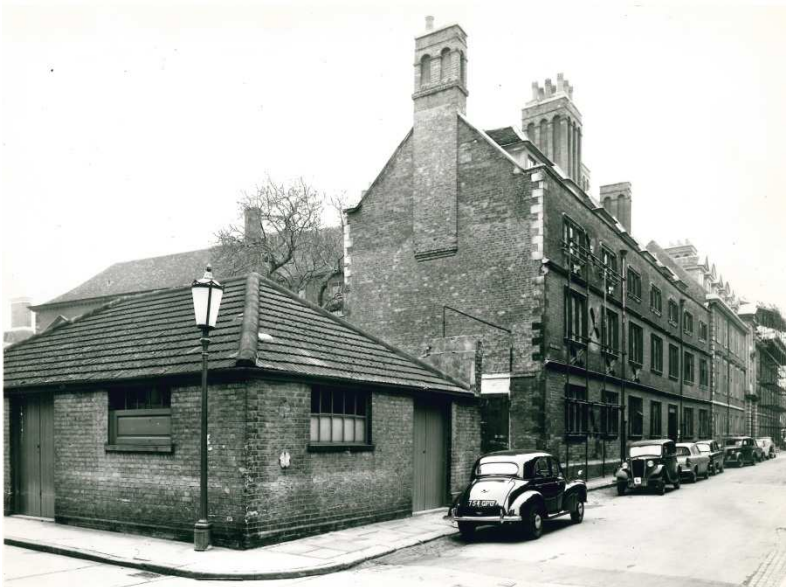
View of Queens' Lane from the corner with King's Lane, c. 1965. Reference: PHOT/3/24/2.

Changes have continued along Queens' Lane. The photographs below were taken just before King's College and St. Catharine's embarked upon their joint building project over King's Lane.