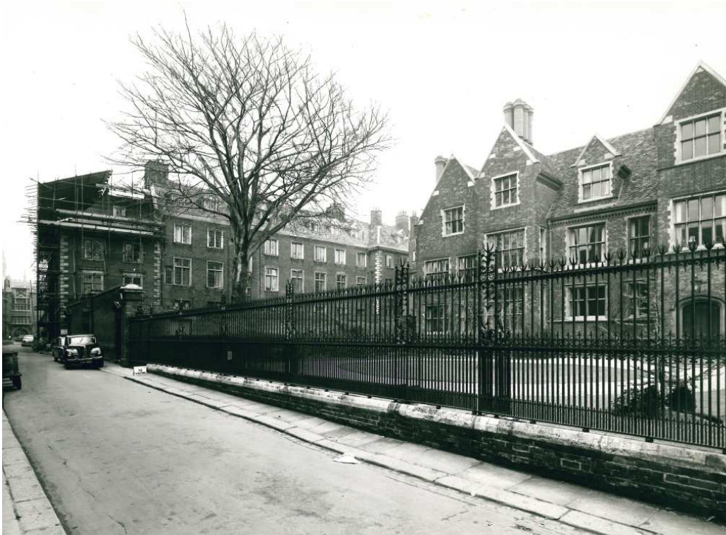
View of the Master's Lodge from Queens' Lane, c. 1965. Reference: PHOT/3/11/2

The garden at the front of the Lodge has changed over time. The view in this picture from the 1960s shows an open drive area. Today bushes and shrubs obscure the view of the Lodge.