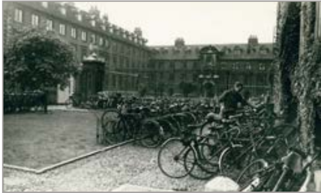
College frontage, c.1950-70