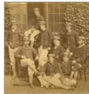
Rowing team, 1876