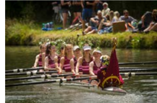
May Bumps, 2018

Today, St Catharine's is a thriving community comprising the Master, around 120 Fellows, some 230 graduate students and about 450 undergraduates. The College is committed to academic excellence and success, while maintaining a relaxed and sociable atmosphere.